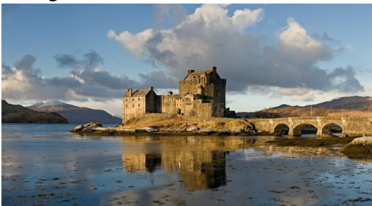
Medieval castle in Scotland

By 1296 the Highland line was clearly established culturally as well as geographically. In the 400 years from Kenneth MacAlpin to Alexander III, Scotland travelled from the land of legend and myth into the realm of history. The Picts, Britons and Angles merged into one people with a common law, language and religion. The highland clan system had also developed during these years, with the great clans growing stronger.